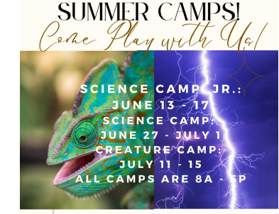
SCIENCE CAMP: Explosions and Electricity! Join us as we learn all about how electricity works and what an explosion is! June 13-17 we

Looking for a fun week of learning for a child? Join Academic Outreach, Continuing and Professional Education and the Science Education Center in one (or more!) of our fun-filled science-themed week-long day camps! Registration is limited to 15 campers per week, so register now!