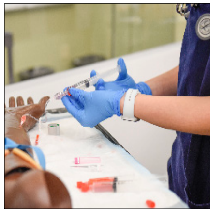
New Lettie Page Whitehead Nursing Scholar's Program helps low-income students reach their dreams of becoming nurses.

The four-year, cohort-based program provides full scholarship to qualified incoming nursing students. Funding pays for tuition, fees, housing, meals, textbooks, nursing program fees and one healthcare-related study abroad.