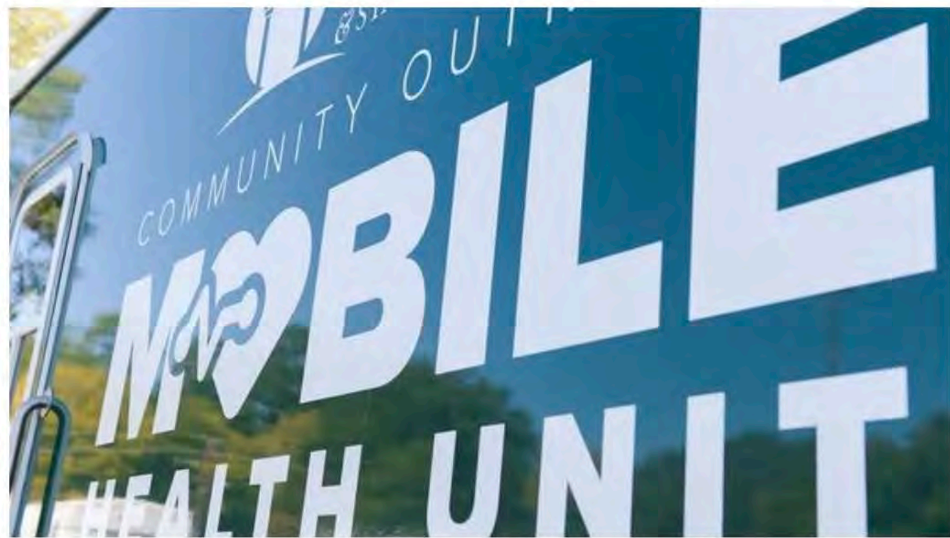
Mobile Health Unit.

The over-40-foot-long Mobile Health Unit has three retractable awnings, two intake areas, two medical exam rooms, refrigeration for vaccines and a bathroom.