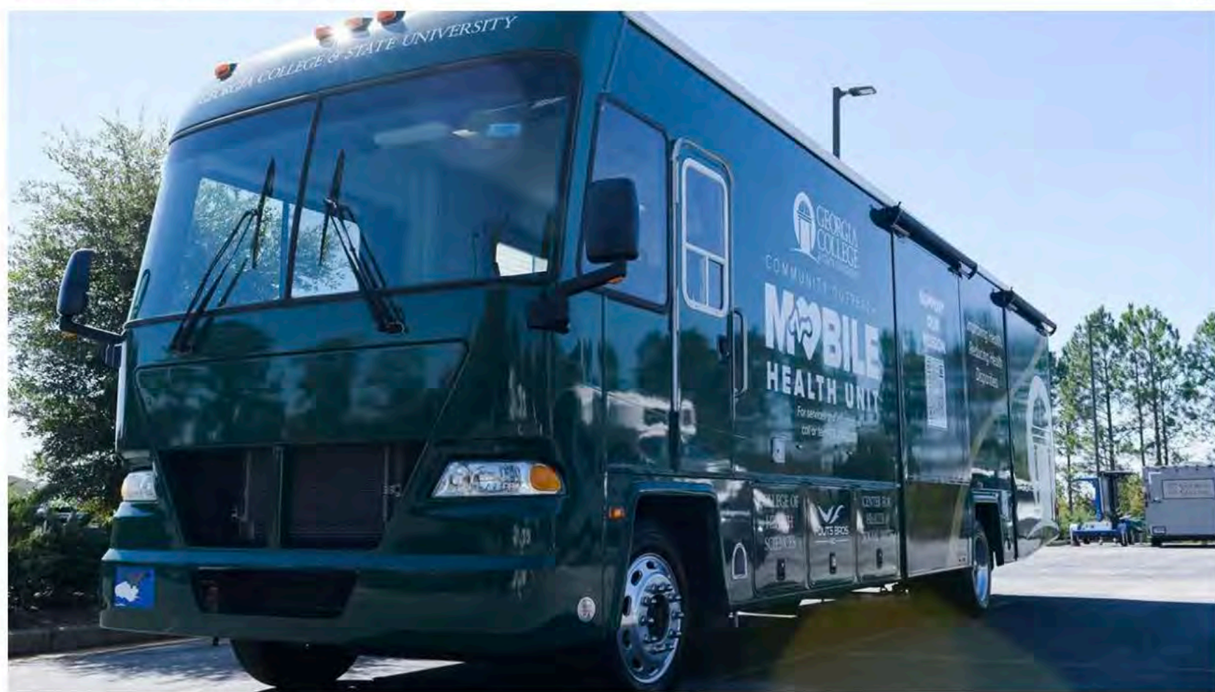
Mobile Health Unit.