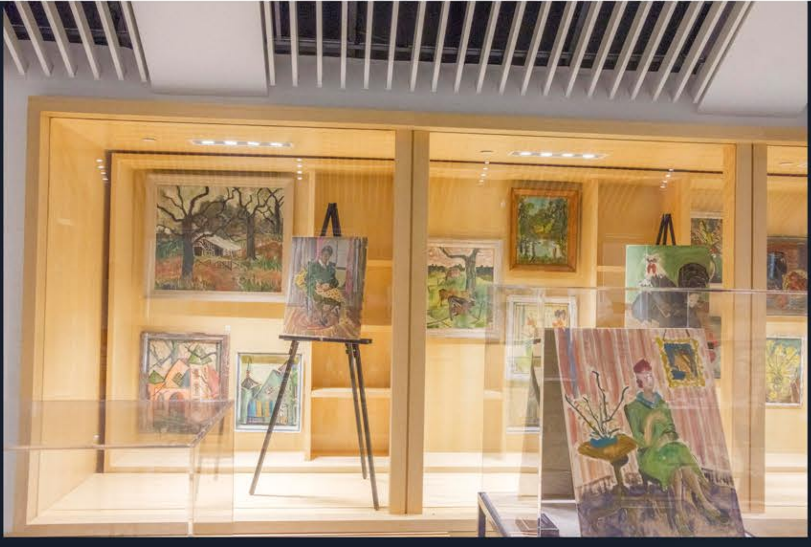
Previously unknown paintings by author Flannery O'Connor stand on display in Milledgeville, Ga.