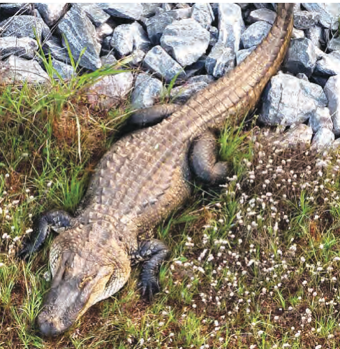
On May 15, Baldwin County deputies responded to a call about an alligator in the roadway on Vinson Highway near the Fall Line Freeway.