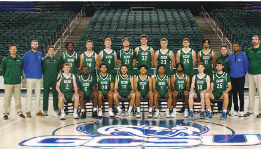
Georgia College & State University's 2024-25 men's basketball team is pictured on its home court in the Centennial Center.

The Peach Belt Conference has announced that Georgia College & State University has won the 2024-25 Men's Basketball Team Sportsmanship Award. The PBC began its Team Sportsmanship Award program in the 2008-09 season. The program presents an award following each championship season to the team in that sport that best exemplifies the spirit of sports-manship and generally conducts itself with a high degree of integrity, character and class. The team award is selected by other teams who compete in that sport. Points are awarded based on how each team finished in the voting and in June, the institution with the highest totals will receive the PBC Institution of the Year Sportsmanship Award. GCSU won the men's basketball award for the fifth time in the last six years with its third in a row. The award is the 31st overall, second most among all PBC institutions, for the Bobcats athletics program. The PBC senior woman administrators council oversees the program.